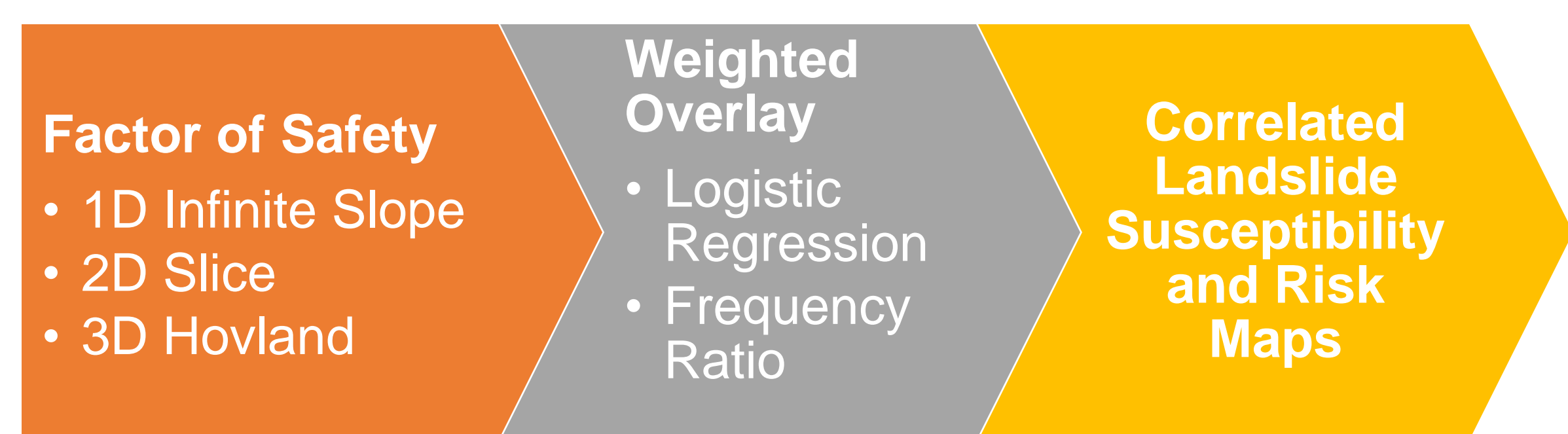
Figure 2: Models used in ArcGIS to map landslides which were applied to a watershed in Washington state, Japan, and India.