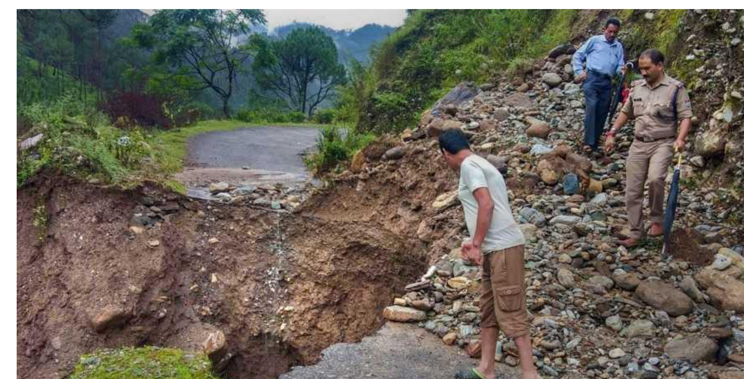
Figure 5: Landslide caused by heavy rainfall in Uttarakhand, India

The effect of seismicity and liquefaction were not included in this, because of low availability of public data. However, these factors have a known effect on landslide susceptibility.